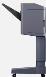
PH-7A 2/3 Hole Punch Unit for the DF-7120 Finisher Resides in the Finisher