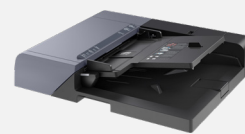
DP-7140 Reversing Auto Document Processor 50-sheet capacity 50 ipm simplex / 16 ipm duplex