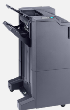
DF-791 3,000-sheet Finisher Staples up to 65-sheets