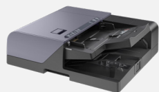
DP-7170 Dual Scan Document Processor 320-sheet capacity w/ multi-feed & staple detect 100 ipm simplex / 200 ipm duplex