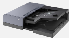
DP-7150 Reversing Auto Document Processor 140-sheet capacity 80 ipm simplex / 48 ipm duplex